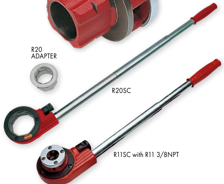
R11SC with R11 3/8NPT