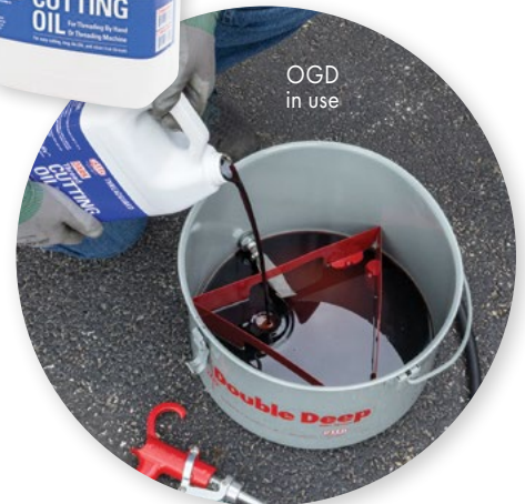
OGD in use

Higher lubricity for longer die life and faster cutting speed.