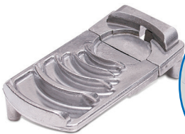
DEB4 De-burring Tool

3. Create a 15 degree chamfer. After cutting, remove all burrs from the outside of the pipe with a de-burring tool. Failure to remove burrs can scrape channels into pre-softened surfaces, or inadvertently plow cement out of the joint during assembly. BEST AND CLEANEST TOOL IS A DEB4 DEBURRING TOOL