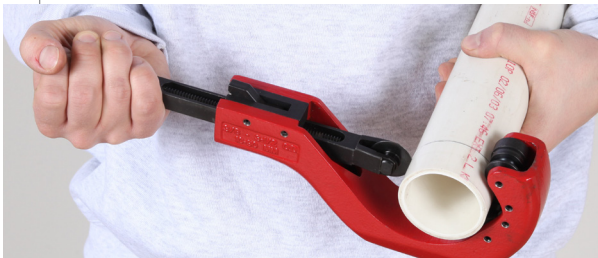
TC30PVC Quick Release™ Tubing Cutter

2. Make a clean, square cut. Pipe must be cut as square as possible since a diagonal cut would reduce the fusing area in the most critical area of the joint. BEST AND CLEANEST TOOL IS A PVC/CPVC TUBING CUTTER. Do not use tools such as chop saws, hack saws, etc which will create statically charged plastic waste that will damage appliances.